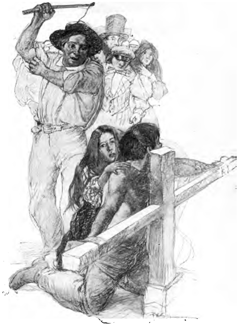
She flung herself in front of MacDougall.—Page 110